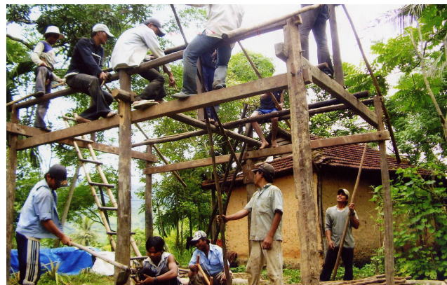
Members of a local church build a home for a neighbor in Southeast Asia.

Yet God has a strategy to decisively confront this brokenness and bring healing and restoration to all things broken through the Fall. At the vanguard of this glorious redemptive movement is Jesus Christ, whose blood was shed on the cross to “reconcile all things” (Col. 1:20).