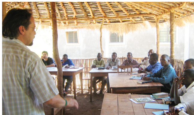
A Vision Conference in rural Mozambique.

THIRD, we catalyze and support indigenous DNA regional networks and national organizations that, in turn, train and support local champions who take ownership for accomplishing the purpose of the Disciple Nations Alliance in their nation or region.