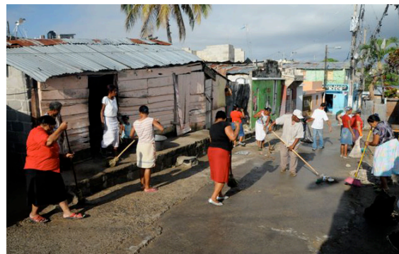
Thousands of local church “Seed Projects” are the fruit of DNA teaching. This slum church in Brazil cleans a community street.