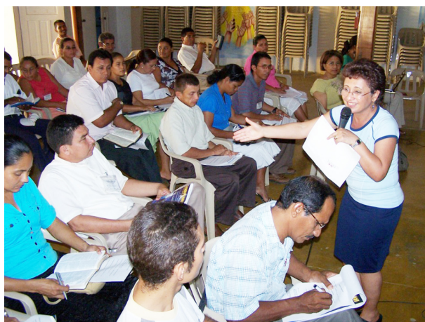
More than 300 talented local trainers and champions are impacting churches around the world.

SECOND, we equip and empower “champions” who contextualize and spread these messages and teachings at the local level, and help local churches put them into practice.