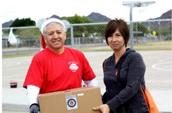
A DNA partner church in Phoenix, Arizona works with a local school to distribute boxes of food to families in need during school breaks.